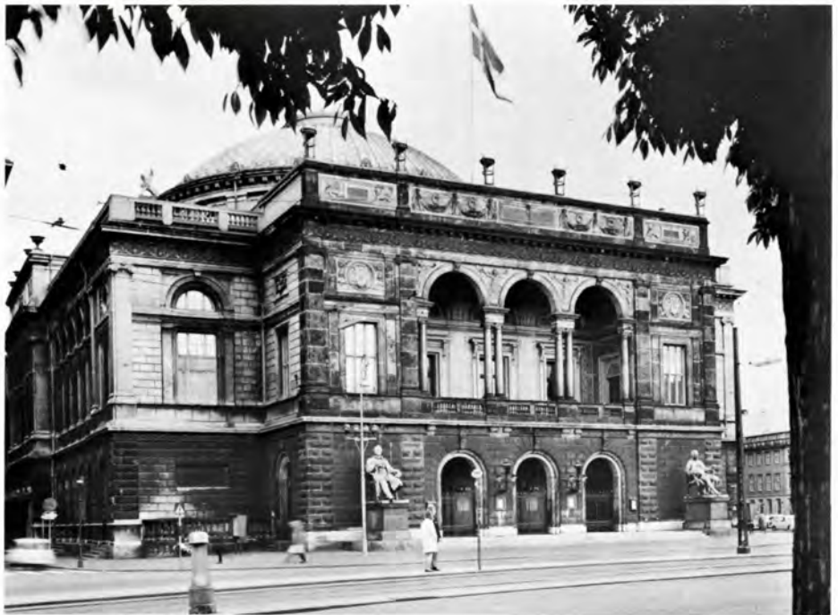
The Royal Theatre in Copenhagen.

August Bournonville – 1805–1879 – succeeded his father as leader of the Royal Ballet and he was the ballet's inspiring leader from 1830 to 1877. He became a close friend of Hans Christian Andersen whose fairy-tales inspired many of his ballets, and he himself became known far