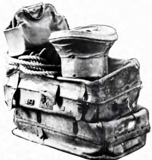
The Hans Christian Andersen exhibition in Beijing, sponsored by our Company, will present first-editions of the great poet's fairy-tales, paper cuts, and his personal traveling kit (pictured above).

At the time of his death Andersen had long been recognised as “the Great Dane” of his century. Through his art he had made the name of Denmark known all over the world, and during his lifetime he received all sorts of honours and citations. His own king and foreign monarchs conferred decorations and titles upon him; his native town, Odense, made him an honorary citizen, in Copenhagen a statue of him was erected. Some of his fairy-tales are presented at an open air theatre in Odense every summer. And Hans Christian Andersen became one of the most popular foreign authors in China.