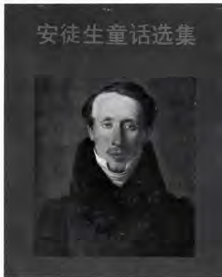
Forsiden af Kompagniets complimentsbog med H. C. Andersen-eventyr.

Front page of our Company's complimentary book with Hans Christian Andersen fairy-tales.