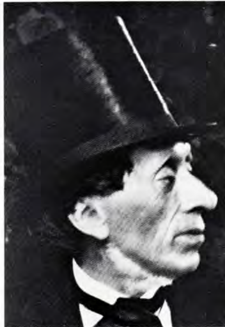
“Denmark's most celebrated writer”

At the age of 14, Hans Christian Andersen left his native Odense to seek his fortune in the capital of Copenhagen. His innate beautiful singing voice had imbued him with the firm belief that he was pre-