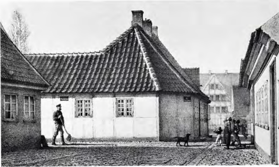
Hans Christian Andersen's house in Odense.